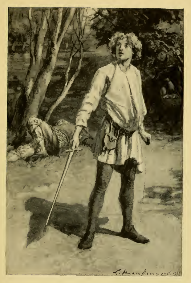
WALLACE PUT THE ENGLISHMEN TO FLIGHT