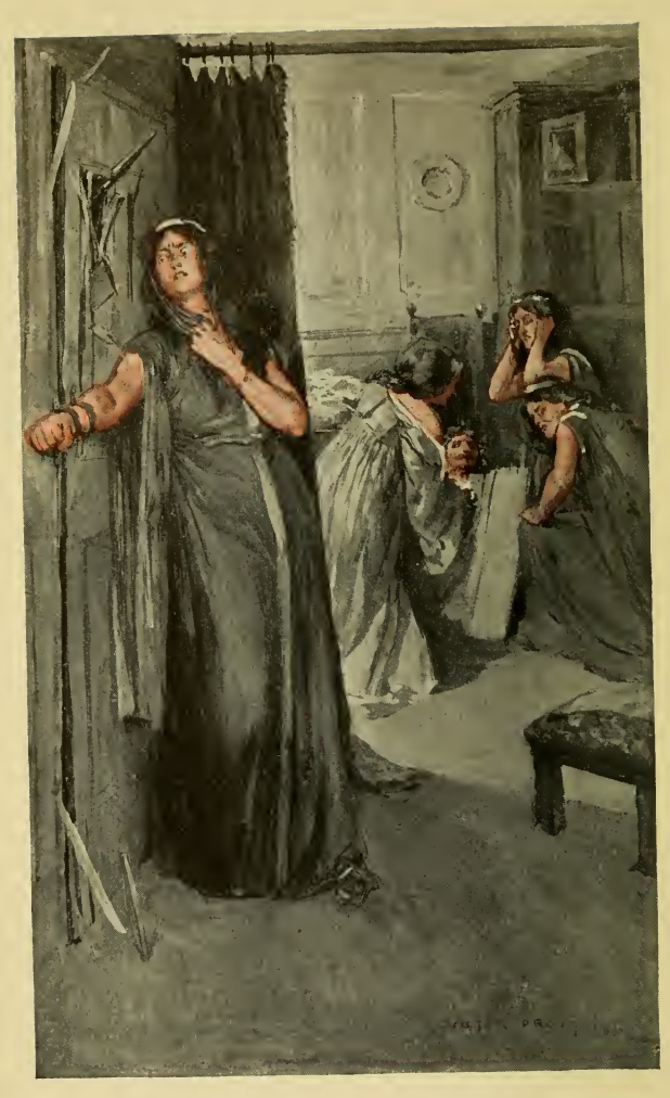
CATHERINE THRUST HER OWN ARM ACROSS THE DOOR