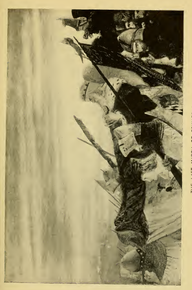
THE LAST MARCH OF EDWARD IS