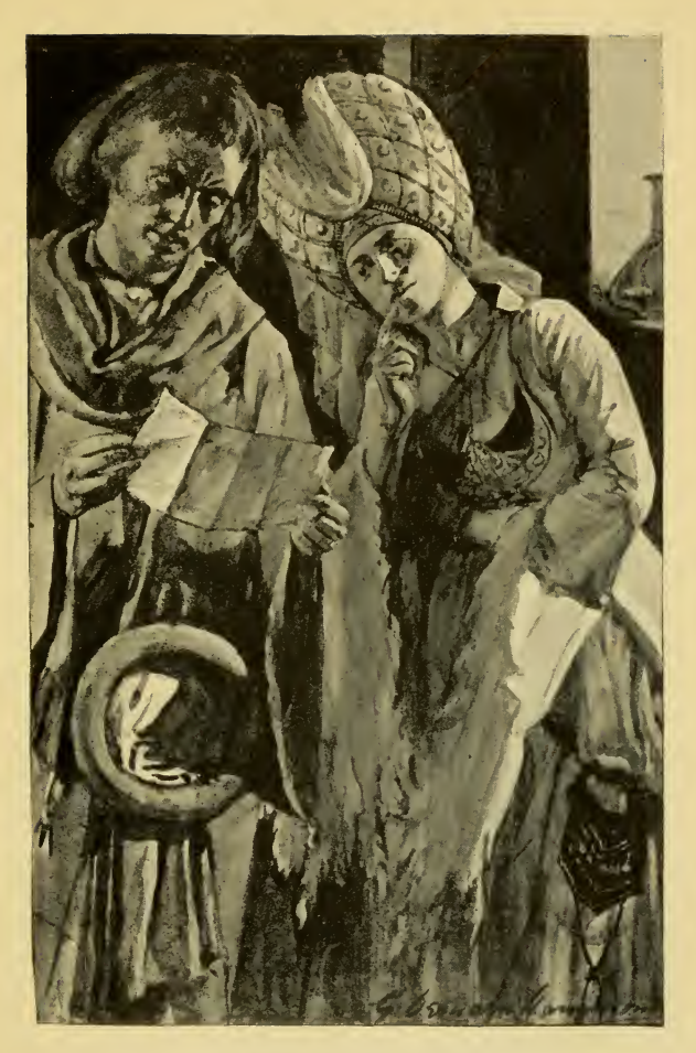
THEY MADE OUT THE WRITING