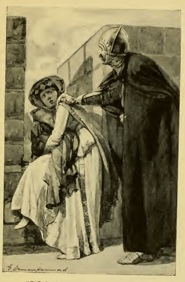
"THE BLACK DOUGLAS SHALL NOT GET YE"